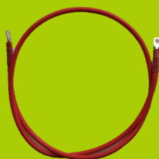
3: Negative Cable